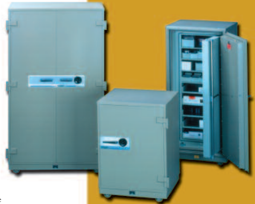
Record and media safes available with a variety of optional interior accessories.

Our MediaCase can also be placed into any paper document rated product for a comprehensive fire-rated storage solution.