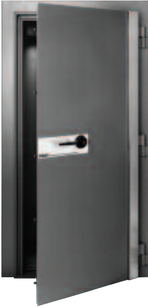
Insulated vault door