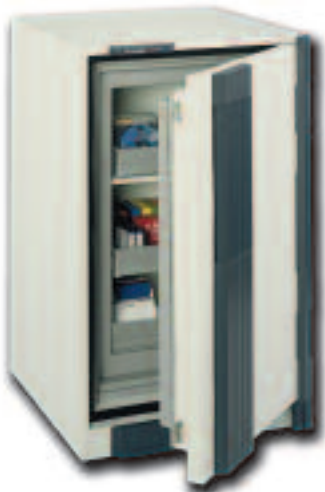
Media cabinet shown with a variety of optional interior accessories.

All key-lock cabinets can be ordered with an optional digital or combination lock for the added protection. Our seamless and appealing construction with concealed hinges, handle and lock, combined with an attractive color selection – off-white and gray trimmed in charcoal – result in a contemporary and aesthetically pleasing look. Caster base and/or floor mounts are optional accessories on most models.