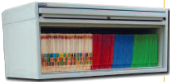
Side-tab lateral fire-resistant file cabinet.