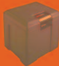
The MediaCase provides portable, safe storage for all media types.