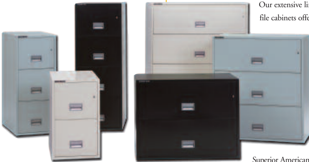
Vertical and lateral fire and impact resistant file cabinets.

Our extensive line of SafeTec vertical and lateral fire-resistant file cabinets offers a convenient way to protect your vital business records. Available in a variety of colors, depths and sizes, our versatile cabinets can provide protection anywhere in the office. Optional interior accessories are also available, including caster bases, stackable trays and drawer-in-a-drawer inserts for small item storage.