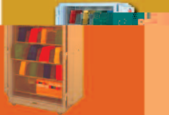
Record Safe offers optional side tab filing.